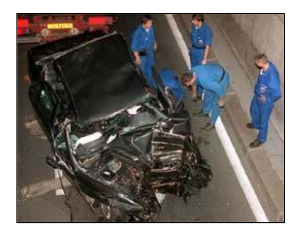
SMASH: Twisted wreckage of the Mercedes Diana was travelling in

believed there was a concerted attempt to undermine her in the public's eyes.